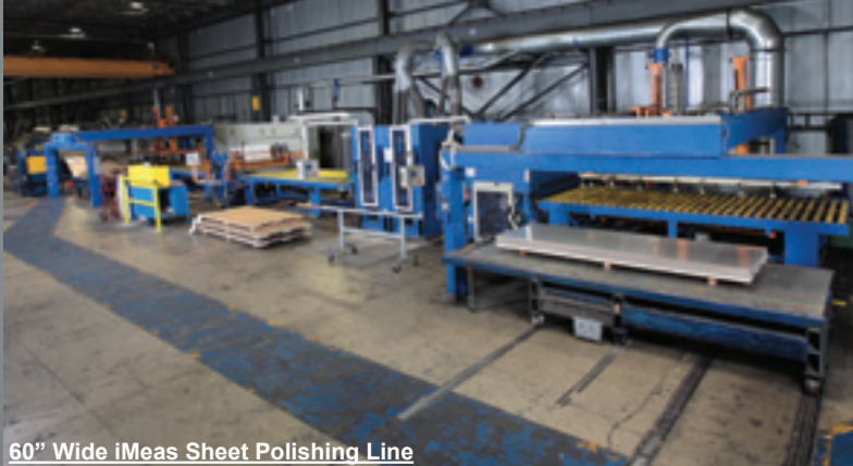
60" Wide iMeas Sheet Polishing Line