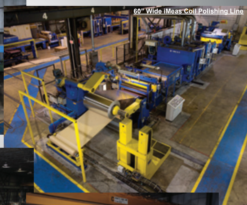
60" Wide iMeas Coil Polishing Line