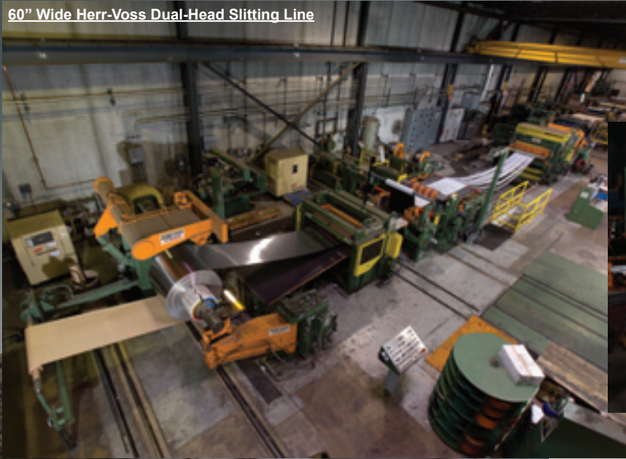
60" Wide Herr-Voss Dual-Head Slitting Line