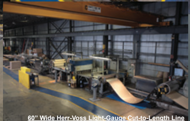
60" Wide Herr-Voss Light-Gauge Cut-to-Length Line