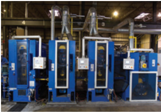
60" Wide Polishing Heads from our Coil Polisher

WE CAN EVEN CUSTOM MATCH FINISHES ON OUR POLISHING EQUIPMENT