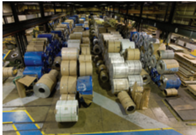
Our Coil Field in Carol Stream, Illinois

FINISHES include 2B/2D - #3 OR #4 Wet / Dry Polish - #1BA - Best Brite - #2BA - CUSTOM